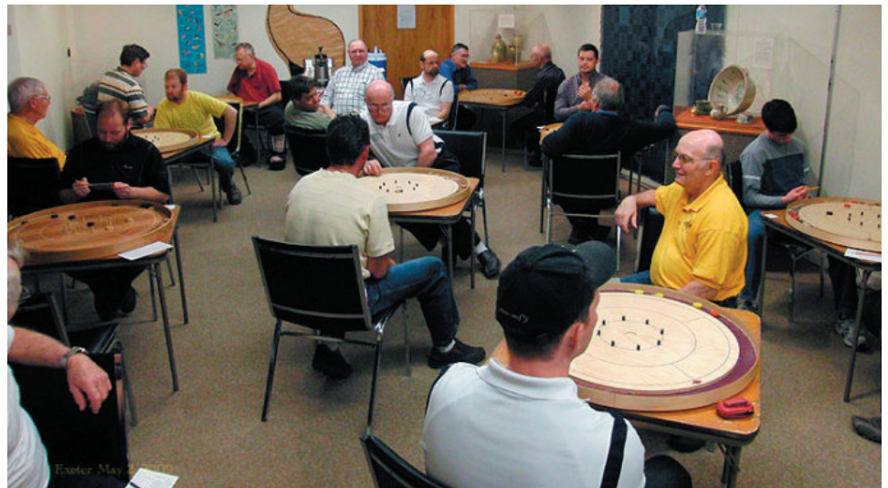
Below: Participants at the Exeter Tournament