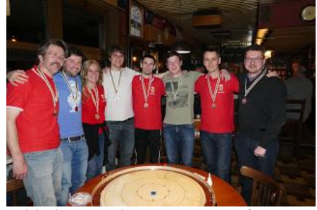
With the annual tournament set for Saturday, the Friday evening before saw

While some have said the re-emergence of crokinole is a back-lash to the new media of the 21st century, it should be noted that the idea for the international match came about from the Belgian Crokinole Facebook page on the request of the Hungarian team.