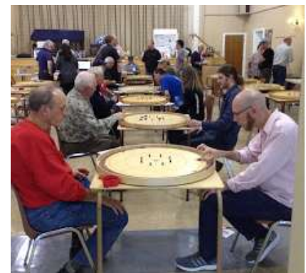
Forest City Preliminary Round